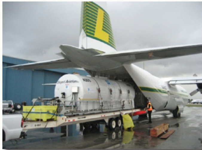
CCA activated Lynden Air Cargo and loaded the ADDS aboard a C-130 Hercules aircraft for deployment to the Gulf of Mexico. We have a contract with Lynden to provide a Hercules on an emergency basis.