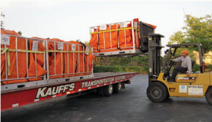
Containment boom being prepared for shipment from CCA's Fort Lauderdale warehouse. Over two days, 13 truckloads of dispersant and equipment were trucked to the Gulf of Mexico.