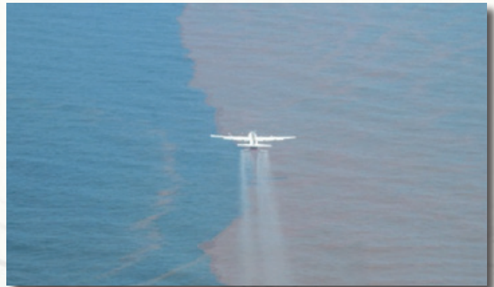
Seen from above, the CCA ADDS with "spray on" over the leading edge of the Deepwater Horizon oil slick.